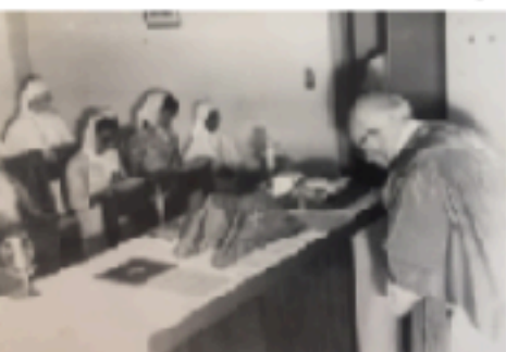
First Mass, 1968