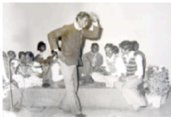
Dance performance by non-teaching staff