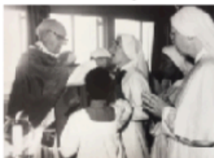
First Communion, 1968