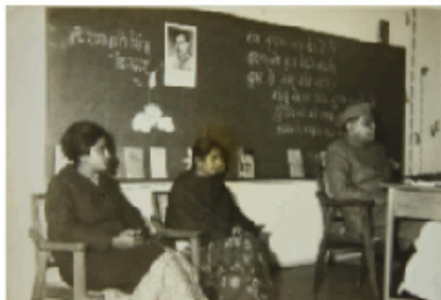
Ramdhari Singh 'Dinkar'