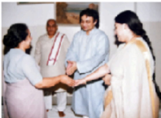
Birju Maharaj and Shubha Mudgal