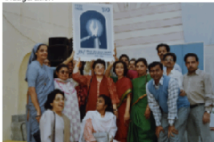
Launching the silver jubilee stamp